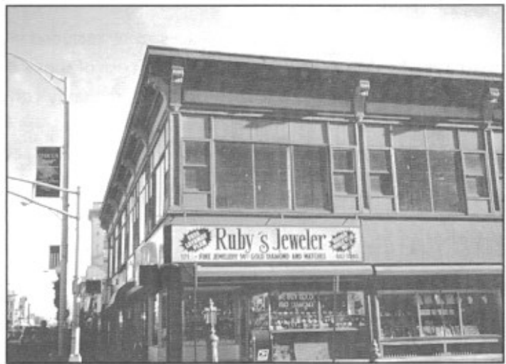
This vacant second-story space in downtown Perth Amboy is suitable for housing educational programs.

Thus, while the Abbott legislation will benefit all of the school districts in the state, both ratable-rich and ratable-poor, it is crucial for the conversation about how to leverage the state's investment in schools to focus on the impoverished districts, which are primarily, but not exclusively, urban.