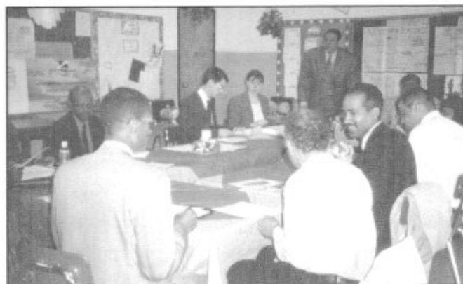
Involving community members is key to the planning and creation of community schools. These stakeholders shown here are taking part in a planning session for the new Belmont Runyon School in Newark, generating ideas on how to include community facilities with educational facilities.

Over the past year and a half, the Office of State Planning has been involved in a "Communities of Learning" initiative. This effort has aimed at helping