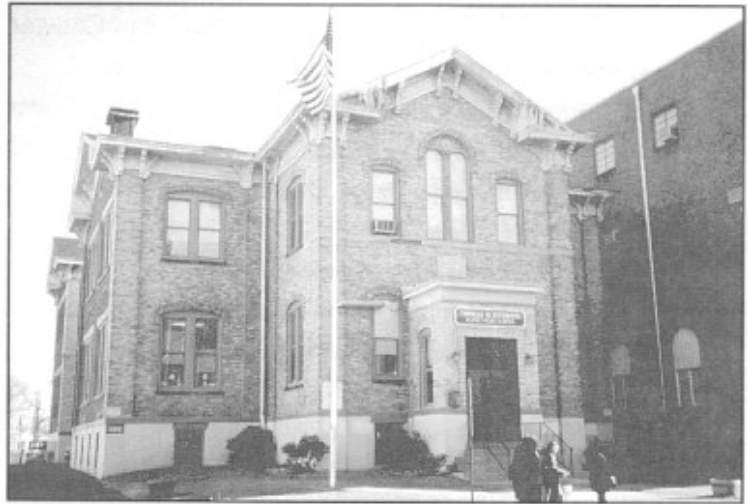
This old school building in Perth Amboy illustrates the opportunity to preserve an architecturally distinctive facility that is conveniently located to downtown neighborhoods.

A good source of models of urban opportunism is the charter school movement. In New Jersey charter schools have to live within frugal facilities budgets, by taking advantage of small sites, existing buildings, and general development activity.