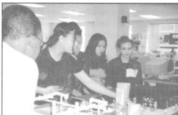
These middle school students are participating in the Paterson Design Arts Academy that is housed in what was a vacant, second-story downtown mall. They are working on models for renovations and additions to one of the local schools.

Already, several New Jersey communities, including Paterson, Hoboken, Plainfield and Newark, are seizing the opportunity presented by the schools construction program in different and exciting ways.